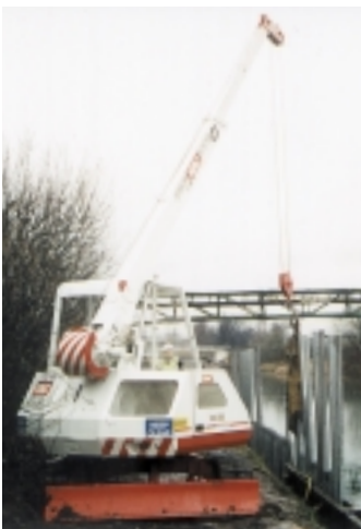
CX-3T ▲ Riverbank piling duties along narrow canal banks with site accessed under low bridges ▼