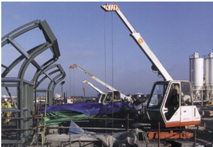
CX-3T ▲ Air-lifted onto sluice gate headings for Shuttering & Formwork duties at Cardiff Barrage