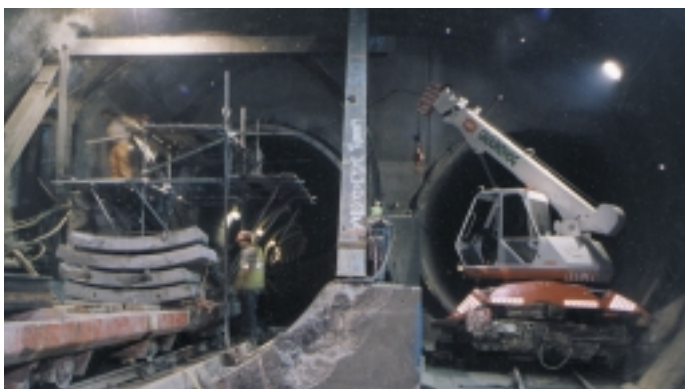
CX-8T – Underground on the Heathrow Express project lifting 1 Tonne tunnel segments into position at a radius of 6.5m with boom at 10m, from adjacent rail position. ▲