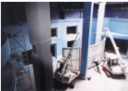
◀ Two CX-3T Starlifters manoeuvred 3.5 tonne acrylic panels into position providing safe viewing windows for tourists visiting new aquaria in the basement at London's old County Hall