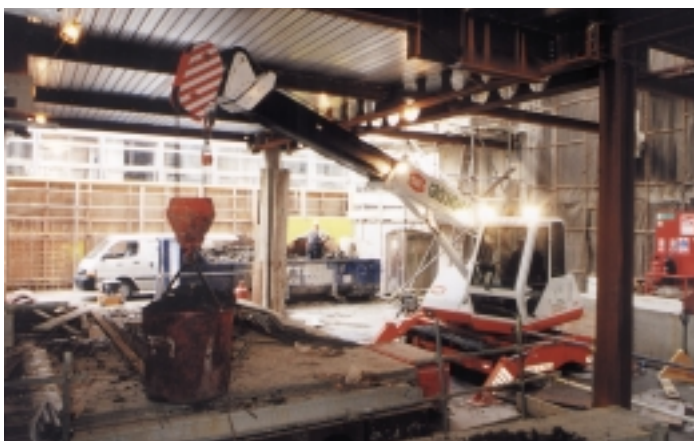
CX-8T – Working under low headroom in Savile Row, London ▲