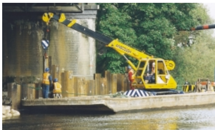
▲ Afloat on the River Avon, a CX-8T works installing Interlocking sheet piling under the low headroom of a mainline London/East Coast railway bridge.